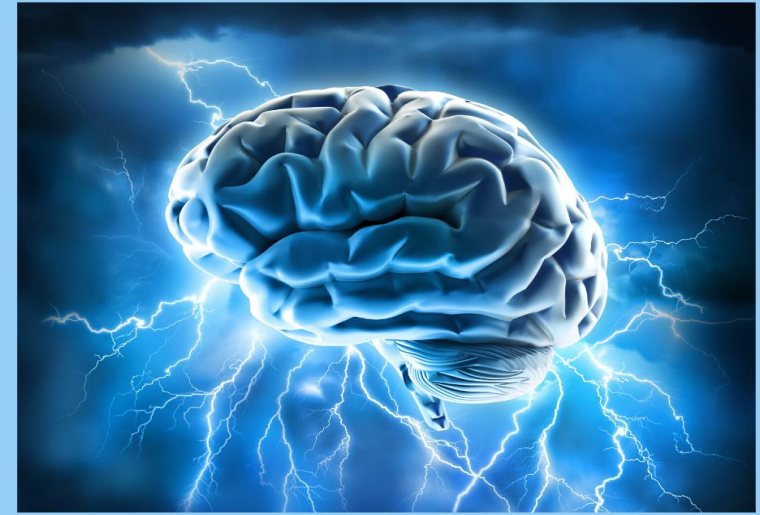
Exhibit Prospectus -Virtual Conference