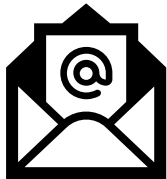
Exhibit Information Email

Checks must be received at least 2 weeks prior to the activity.